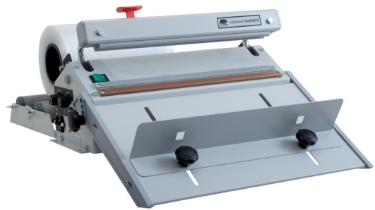
321 MG + OTST 321 + RL 321