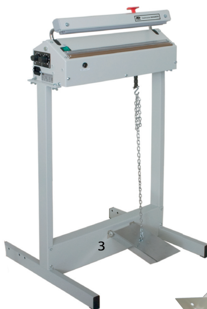
Sealmaster Magneta on support