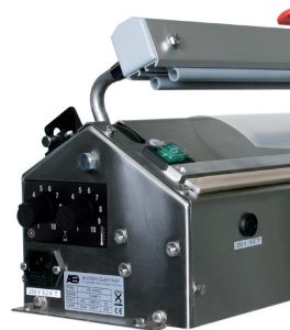
MG(M)S - Stainless steel