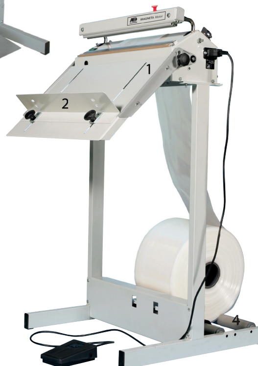
Accessories Magneta Motor & Sealmaster Magneta