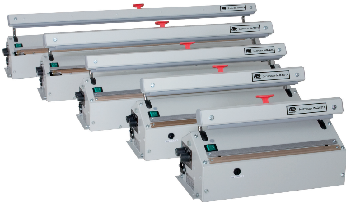
Sealmaster Magneta series

The MGS model of the Sealmaster Magneta is made out of stainless steel for special applications like the food industry or for clinical environments. The MGS has a stainless steel housing and accessories. All the other characteristics are identical to the standard model. The options like the support table and the support are also available in stainless steel.