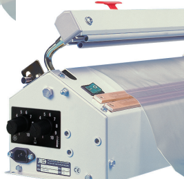
MG(M)T - Twin seal