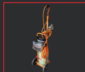
936 GAS BOTTLE TROLLEY