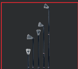
RIPACK GUN EXTENSION POLES